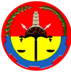
የትግራይ ክልል ከተማ ልማት፣ ንግድና ኢንዱስትሪ ቢሮ Tigray Bureau of Urban Development, Trade and Industry