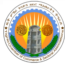
የትግራይ የንግድና የዘርፍ ማኅበራት ምክር ቤት Tigray chamber of Commerce & Sectoral Association